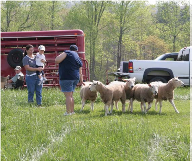
"Off for a stroll, the grass looks great"