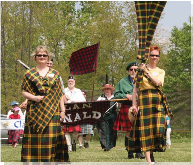
"The Marching of the Clans"